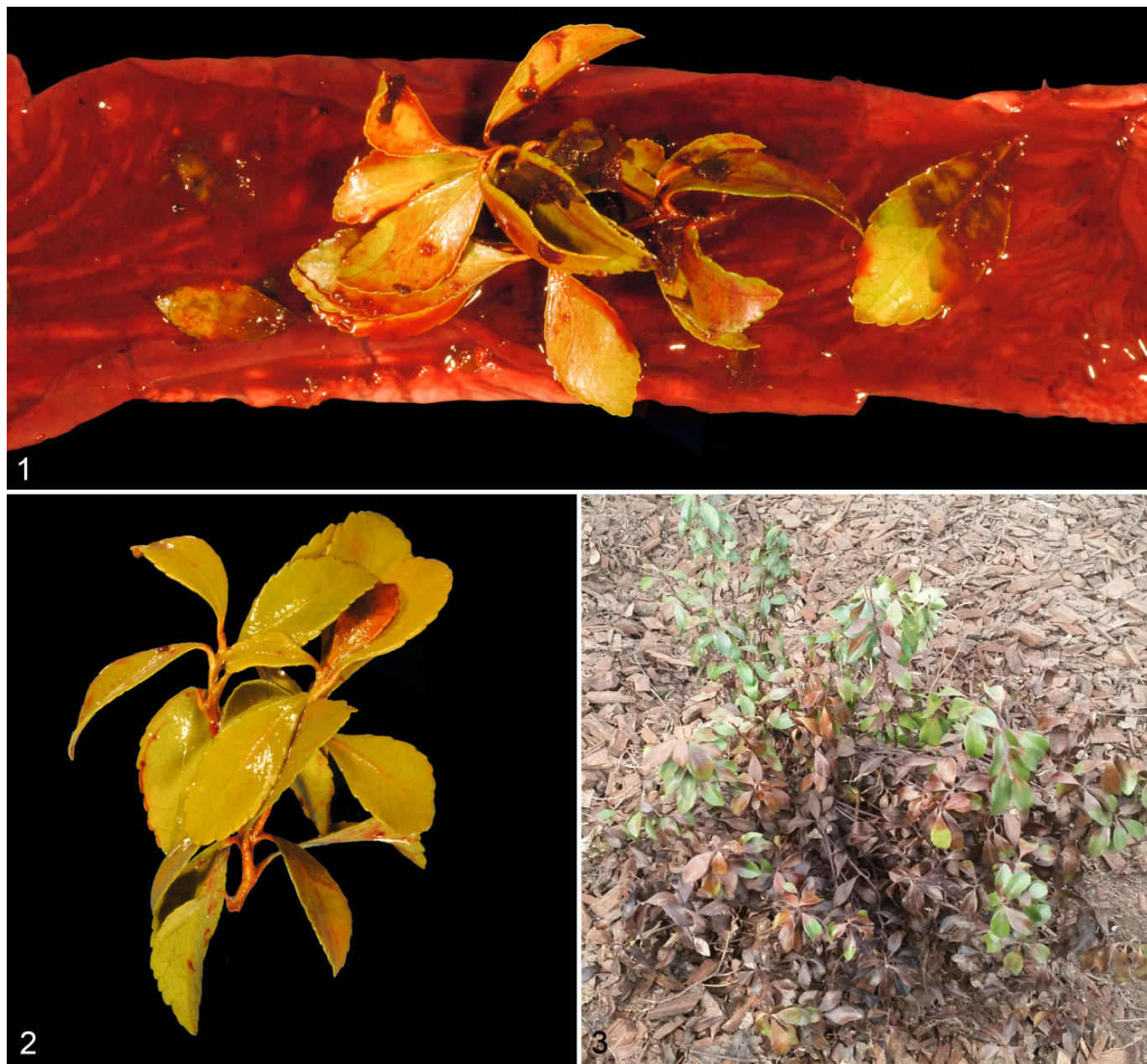
Figs. 1–3. Pieris japonica toxicity, miniature pig. Figs. 1, 2. Plant material was found in a hyperemic segment of the small intestine. The ingested plant was botanically phenotyped as Pieris japonica . Fig. 3. Pieris japonica planted in the pig owner's yard.

The animal was in good nutritional status and moderately cyanotic. Multifocal, acute, petechial hemorrhages were identified in the epicardium around the coronary vessels. A segment of the duodenum and proximal jejunum was severely hyperemic and contained numerous plant materials (Fig. 1). All other parts of the gastrointestinal tract were properly filled with normal content. Additionally, a mild urolithiasis was diagnosed.