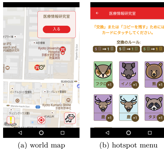
(a) world map

Using the map (Fig. 3(a)), players can locate nearby hotspots and receive some card by visiting them. Cards are earned the first time within a day that the player enters a shrine and periodically depending on how much they walked and how many hotspots they visited on the previous days.