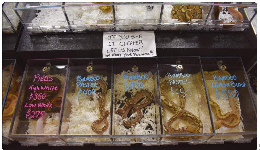
Figure 2. Keeping vertebrate species as pets has increased greatly in popularity over the past several decades worldwide. Today's markets for exotic pets include direct sales through traditional outlets (eg pet stores) but also through sales of animals directly to consumers via online forums and pet fairs ("expos") as shown here. Some fraction of these purchased animals will escape confinement or be deliberately released and consequently have the opportunity to establish as non-native species.

The rise of trade via non-traditional marketplaces (eg websites, fairs, social media) has vastly expanded direct-to-consumer sales (Figure 2), raising the importance of this pathway for analysis and enforcement. Although this pathway is more often associated with trade in non-living wildlife products (eg ivory, leather, feathers), trade in live species is substantial. Stringham and Lockwood (2018) documented 94,230 unique individual pet listings (representing 652 species) on three popular reptile and amphibian web vendors in the US between 2012 and 2016. Similarly, a survey of Facebook listings in the Philippines uncovered 1623 live birds and reptiles for sale over a 17-day period (Canlas et al. 2017). Grein and Chen (2018) reported that eBay recently removed 45,000 listings over a 12-month period that were not in compliance with their wildlife trade policies.