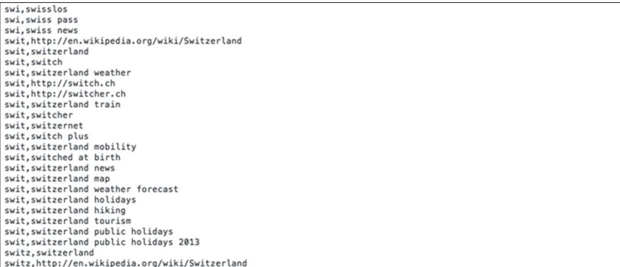
Fig. 5. An excerpt of autocompletion retrievals why typing 'Switzerland' (to the right of the comma are Google's autosuggestions for the expression on the left).

Have you ever misspelled a word in the search query field? Google's algorithms will immediately ask 'Did you mean...?' and suggest the corrected word. Even without misspelling, Google's autocompletion will suggests words and expressions to us before we finish typing . Thus, these algorithms mediate semantically between what we mean and which words we will use to describe it. All of them are so-called 'linguistic prosthesis', potentially impacting the written expression of our thoughts. 16