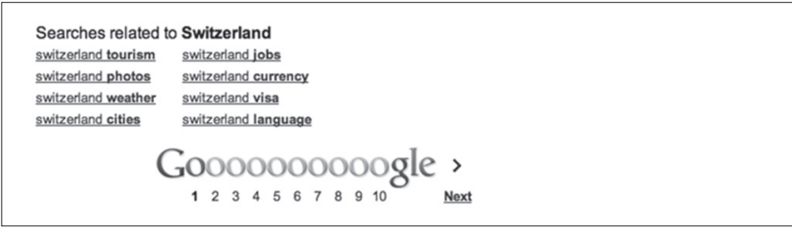
Fig. 4. Related searches to 'Switzerland' on Google Switzerland.

Have you ever misspelled a word in the search query field? Google's algorithms will immediately ask 'Did you mean...?' and suggest the corrected word. Even without misspelling, Google's autocompletion will suggests words and expressions to us before we finish typing . Thus, these algorithms mediate semantically between what we mean and which words we will use to describe it. All of them are so-called 'linguistic prosthesis', potentially impacting the written expression of our thoughts. 16