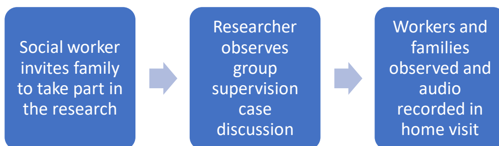
Figure 1: Outline of the research process

Data were collected between May 2015 and March 2016. During this period, social workers were asked to invite families with whom they were currently working to participate in the research. Observations of unit meetings were undertaken and shortly after the meeting - where families consented - researchers joined social workers on a home visit (see Figure 1). Observations of unit meetings were not audio recorded but relied on contemporaneous field notes of researchers following a structured observation schedule (Bostock et al., 2019). Subsequent visits to families were observed and audio recorded by a researcher.