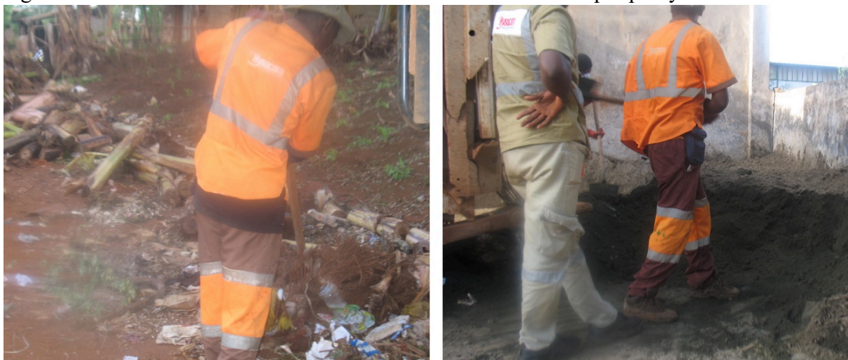
Figure 1: Piles of banana trunks and soil collected from the urban periphery

Furthermore, the pressure to achieve the required tonnage pushes crews to collect materials that are not supposed to go with the household or commercial wastes. A common practice is to take stones and scrape earth when garbage has to be shovelled from the ground. Sometimes the crews deliberately collect heavy soil, construction waste (which should be picked up by municipal services), car tyres, banana trunks, etc. to reach the 10-tonne target.