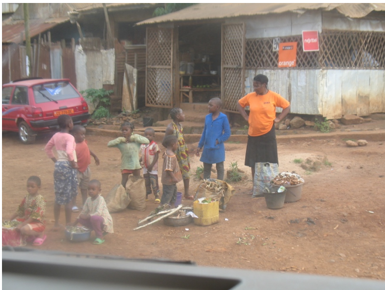
Figure 4: Garbage collection from a collection point on the main street of a peripheral neighbourhood.

In unplanned settlements, by contrast, waste is collected from collection points along the main roads as the trucks are unable to reach the interior of these mostly peripheral neighbourhoods with narrow streets. Here, mostly women and children bring their household rubbish to large bins and containers put up at strategic points.