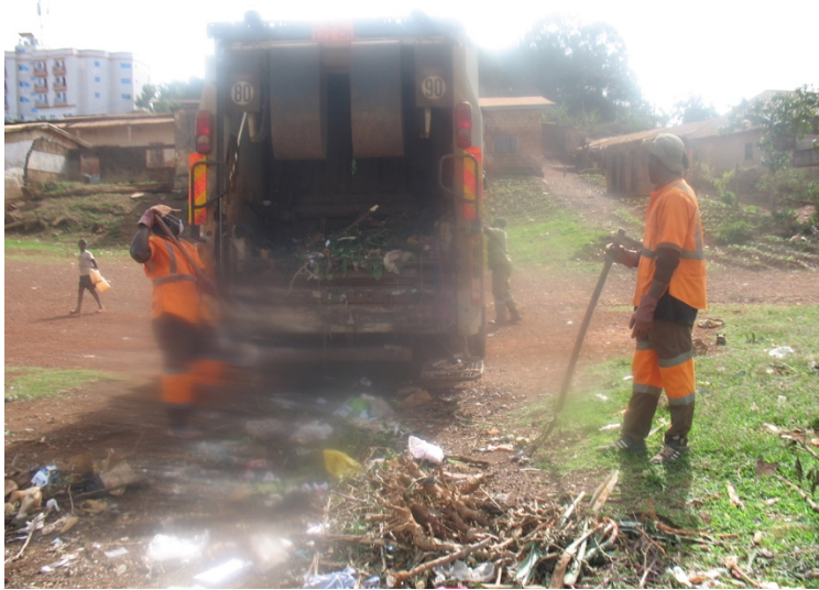
Figure 2: Collecting lightweight waste from the street in a peripheral neighbourhood

As indicated, waste workers also preferred the routes leading through the city centre and planned settlements, because overall consumption and thus waste production are higher in these relatively prosperous neighbourhoods. At the urban periphery, by contrast, we observed that garbage is often composed of a lot light rubbish, such as corn leaves, which does not allow the crews to reach the tonnage quickly.