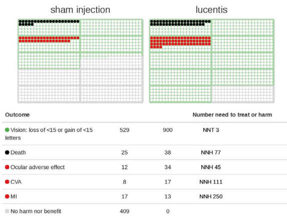
Figure 1 MARINA 24-month data; each dot on this icon array represents the experience of each one of a thousand patients. Benefits are coloured green, death is coloured black, harms are coloured red (when the frequency of an event—in this case visual benefit—exceeds 50% of subjects, the colour surrounds the dot rather than fills it). CVA, cerebrovascular accident; MI, myocardial infarction.

fewer than or gaining 15 Early Treatment Diabetic Retinopathy Study letters (figure 1).