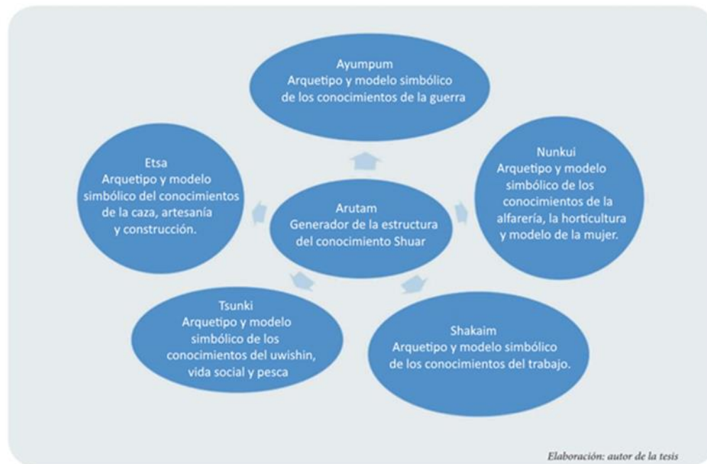
Figure 3. “The pedagogy of Arutam explains the form in which each of the mythical figures [now hypostases/archetypes] conveys forms of knowledge and expertise [saberes y conocimientos] to the Shuar.” (Mashinkiaish 2012:55)

This helps us highlight two key premises of patrimonialization in the educational domain. The first is that even though indigenous educationalists may produce specific interpretations of their cultures, a notion of collective rights governs their intellectual property in the academic domain. The second premise is that indigenous theses represent the knowledge (or “wisdom”) of the whole group. To the question, “To whom does knowledge belong within a specific indigenous society?” Shuar intellectuals opt for a model of corporate ownership: knowledge belongs to the whole of the indigenous nation.