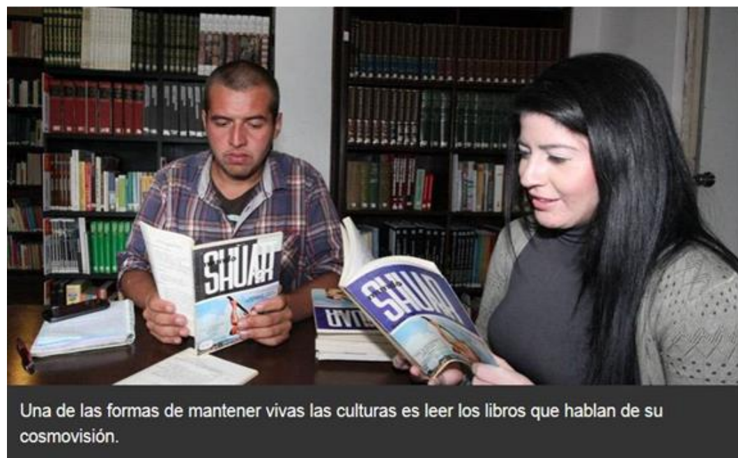
Figure 2. “One of the ways to keep cultures alive is to read books that speak of their [indigenous] worldview.” Screenshot from the newspaper El Tiempo (10/28/2017) http://www.eltiempo.com.ec/noticias/intercultural/27/423630/interculturalidad-en-las-perchas . © El Tiempo

If the principle of plurinationality establishes how diversity ought to be understood in Ecuador, interculturalidad organizes the kinds of relationships occurring between the diverse groups or nationalities in the public sphere. Interculturalidad, or “multiculturalism ‘latino-style’” (Lehmann 2016:4), replaces in theory the assimilationist ideology of mestizaje (racial blending) with an ideology of mutuality. As part of this process, intercultural policies seek to constitute “indigenous cultures” as heritage or patrimony of the country: as national patrimony, indigenous cultures should not only be preserved but also displayed with pride, in the same way as landscapes, artifacts, and monuments. For this reason, in the local governments of regional administrations, the officer in charge of protecting local patrimony is also responsible for promoting tourism. The goal of protecting culture is identified with the exaltation and display of local riches, leading to the spectacularization and commoditization of culture. 16