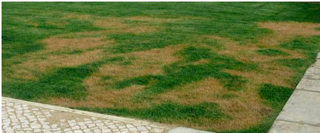
Figure 1: Symptoms of Mesocriconema xenoplax infestation in turfgrass.