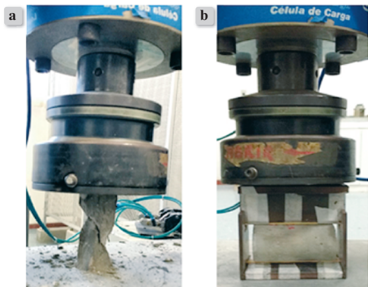
Figure 2. a) compressive strength test setup; b) splitting tensile strength test using an apparatus specially developed for the test

After 28 days, the test specimens' surfaces were regularized for uniform stress distribution in compressive strength test. After that, they were measured and tested on a universal EMIC brand test equipment with load cell of 300 kN for compressive strength test and 20 kN for splitting tensile strength test. The load increment was 0.20 MPa/sec and 1 mm/min respectively. Fig. 2a and Fig. 2b illustrate the compressive strength test and splitting tensile strength test setups, respectively.