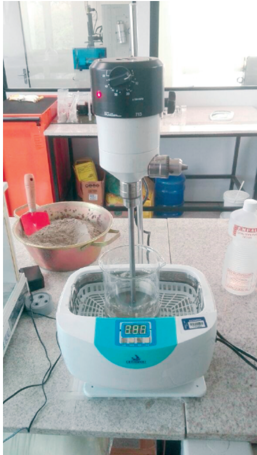
Figure 1. Mixture of cement, CNTs and isopropanol in the ultrasonic bath being mechanically agitated