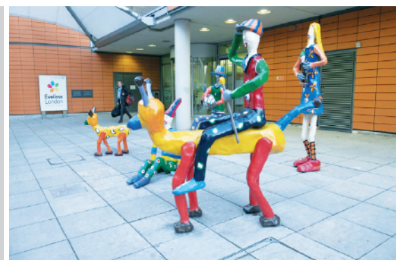
Figure 2. A child-friendly design helps to reduce anxiety in children - Evelina London Children's Hospital, Londyn 2014, Photography: A. Gębczyńska-Janowicz

America. The Hospital for Sick Children building in Toronto is, according to literature, a prototype for such distribution of a medical unit [2]. Drawing inspiration from popular resolutions of public spaces, designers from Zeidler Roberts Partnership