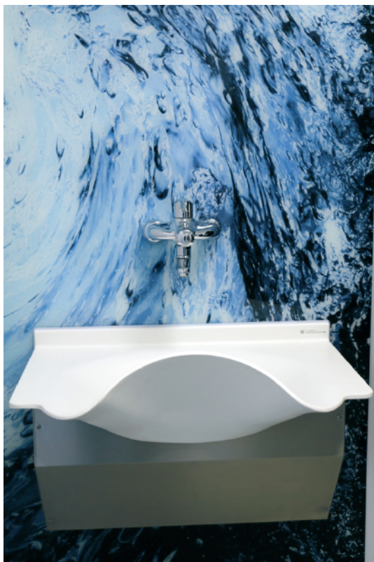
Figure 5. The glass wall with fixed graphics, 2016, Photography: A. Gębczyńska-Janowicz