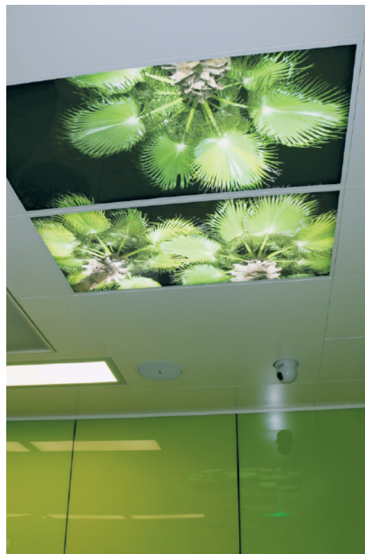
Figure 6. The ceiling art above hospital patient bed, 2016

use), non-porosity and the jointless connection. For the sake of its elasticity at forming shapes it is also used to make worktops and wash basins.