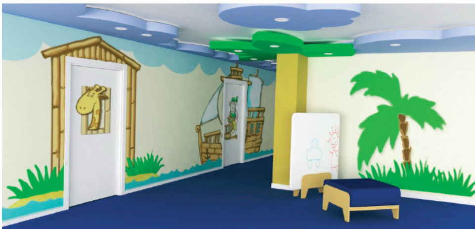
Figure 3. Bright colors and a jungle theme provide distractions for children during their visit in hospital – an example of interior design, authors: B. Misiejko and B. Konarzewska