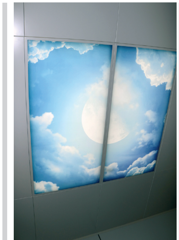
Figure 7. The LED Skylight as innovative ceiling finishing in treatment rooms in hospital, 2016, Photography: A. Gębczyńska-Janowicz

Specialized ceiling tiles of rock wool and metal plates belong to the most popular solutions on the market. Metal plates are more often used in operating