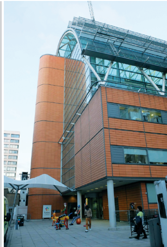
Figure 1. The main entrance is reminiscent of kindergarten or amusement park – Evelina London Children's Hospital, Londyn 2014, Photography: A. Gębczyńska-Janowicz

Additional visual surprises are installed upon entering the hospital, in the main hall, so that the attention of the small patient is not focused exclusively on future examinations and treatments. The search for such solutions resulted in a trend focusing the spatial layout of the hospital on the inner atrium or lobby. In larger objects, a child and its guardians must undergo a registration process within the admission room before they reach the medical zone. The registration point is usually in the lobby – in the space, which resembles the market of a small town. In a metaphorical sense it is a heart of the hospital – its peculiar showcase. It combines various patient-dedicated functions – from administrative issues related to hospitalization to commercial services with shops, pharmacy and restaurants. At the end of the twentieth century many objects were formed in such a way. Hospital's atria are particularly popular in North