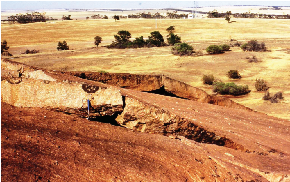
Figure 1. Massive A-tents, almost 60 cm thick, located on the western midslope of granitic Mt Wudinna, north-western Eyre Peninsula. The compressive force necessary to rupture and lift these slabs argues a powerful earthquake in the recent past

ephemeral lakes and waterways. These are the sources of the sediments of which the lunettes are constructed. Some morphological synonyms usefully indicate contrasts in composition. Thus lunettes composed of gypsum, as is commonplace in southern South Australia, are known as kopi dunes, after the Indigenous word for the dominant mineral (Cockburn 1984, p. 123). Similarly, clay dunes in Texas USA, are source-bordering dunes of a particular composition (Coffey 1909).