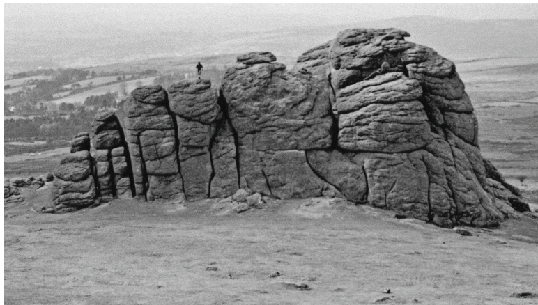
Figure 5(d) Haytor, a classical tor on Dartmoor, south-western England