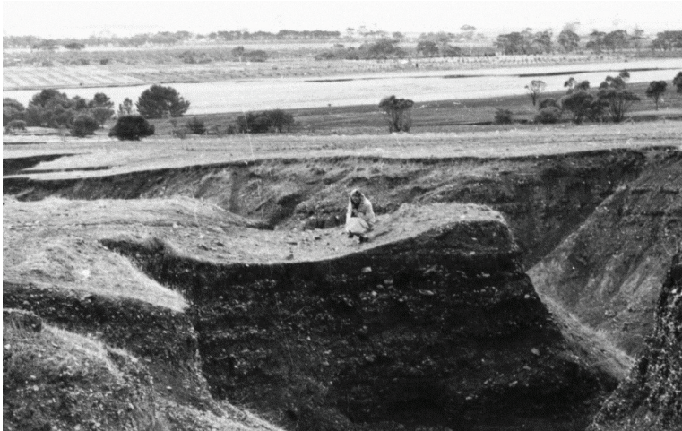
Figure 3(b) Fragment of terrace with part of a stream channel preserved within a gully fronting the Willunga (Fault) Scarp, between Willunga and Sellicks Hill, south of Adelaide

Various classifications have been devised for mass movements of rock and debris, but geomorphologists and geographers can usefully distinguish between landslides involving the slippage of material en bloc and earthflows in which friction with bed and sides has caused differential movement or flow within the mobile mass. A landslide, on the other hand, is a movement of rock along a structural surface such as a bedding plane (Twidale & Bourne 2011). An interesting local example is the Lochiel Landslip (Figure 4).