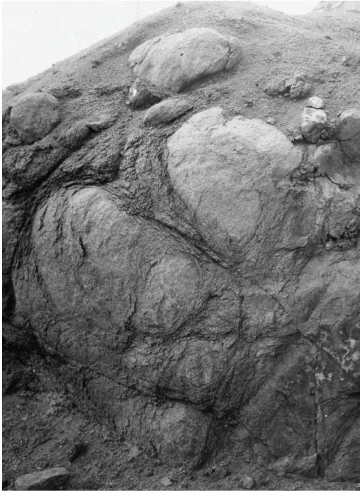
Figure 2(a) Corestones set in a matrix of weathered granite, with one about to be exposed as a boulder at the natural land surface in old quarry, near Palmer, eastern Mt Lofty Ranges