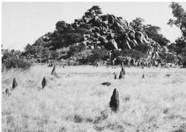
Figure 5(b) Block- and boulder-strewn granite nubbin or knoll, Naraku, north-west Queensland. Note termite mounds on surrounding pediment or plain