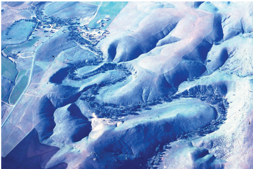
Figure 7. Incised meanders of the Harrison/Reedy Creek, eastern Mt Lofty Ranges, showing Hillydale homestead and Palmer cemetery near the mouth of the gorge

It is now appreciated that although they display various degrees of asymmetry all incised meanders are autogenic or formed during incision, as was pointed out by Mahard (1942). Only the degree of asymmetry varies. Despite this, incised meanders have been construed as inherited from, and evidence of an upland surface of low relief (e.g. Campana 1958).