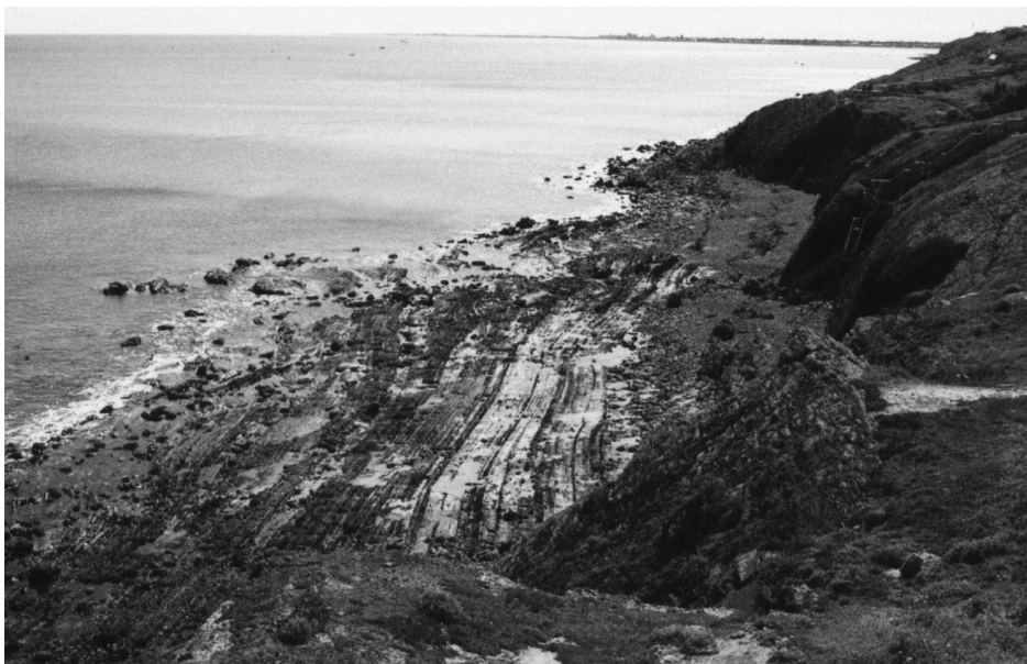
Figure 3(a) Shore platform caused by a mixture of weathering and wave action and cut across dipping sedimentary strata at Hallett Cove, south of Adelaide

Flat or gently-inclined surfaces of limited extent frequently are incorrectly identified. In theory a bench (ledge on the coast) is a structural feature coincident with the outcrop of a resistant stratum or sill, whereas a platform is erosional, and a terrace depositional in origin. Accordingly, the term wave-cut platform, is partly correct but shore platform is preferable because more than wave action—in particular, chemical, biotic, and biochemical processes—is involved in the formation of the feature (Figure 3a). These contributing factors are frequently overlooked. Formerly, a river terrace was used to denote any remnant, or relic, of a former but now dissected valley floor (Figure 3b). While some old valley floors are depositional and ought to be called terraces, some flats are erosional and therefore ought to be described as platforms, and yet others, dissected former valleys, ought to be referred to as benches, for they are structural.