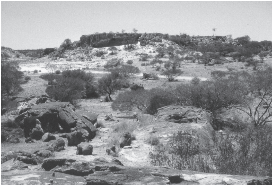
Figure 8 Laterite, consisting of a white clay with a ferruginous capping, as in the flat-topped hill, resulting from the weathering of granite, seen here at The Granites, near Mt Magnet, Western Australia. Dissection and erosion of the laterite has exposed boulders of fresh granite in the valley floor in the foreground

Some workers, however, (e.g. Goudie, 1973) have suggested that this logical and informative nomenclature be extended to embrace all the common types of duricrust, so that not only does 'calcrete' supersede regional names such as caliche (United States, Mexico), kunkar and kankar (India), but 'alcrete' would replace 'bauxite', and 'ferricrete', 'laterite'.