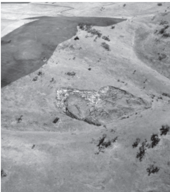
Figure 4 Oblique aerial view of the Lochiel Landslip which formed during the night of 9-10 August in the wet winter of 1974, when a mass of quartzite slipped into the valley along bedding planes lubricated by thin lenses of clay. Left behind were a tension crack and a headwall up to 12 metres high. It continues to collapse as it is being undermined by seepage from the slope above

Various classifications have been devised for mass movements of rock and debris, but geomorphologists and geographers can usefully distinguish between landslides involving the slippage of material en bloc and earthflows in which friction with bed and sides has caused differential movement or flow within the mobile mass. A landslide, on the other hand, is a movement of rock along a structural surface such as a bedding plane (Twidale & Bourne 2011). An interesting local example is the Lochiel Landslip (Figure 4).