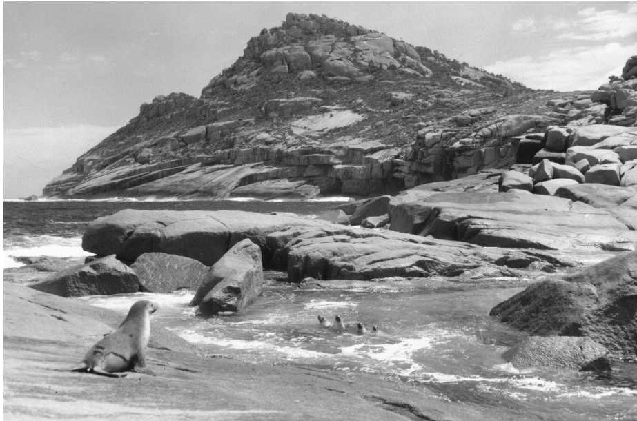
Figure 6(b) Sheet structures or thick slabs developed in granite, exposed on the coast of one of the Pearson Islands, eastern Great Australian Bight

Some words apply to features that appear similar but have been found to be different in origin. Thus 'raised beach' was used of any feature considered to indicate an uplift of the land relative to sea level, despite a beach not necessarily being under consideration, and regardless of whether referring to an uplift of the land or a lowering of sea level.