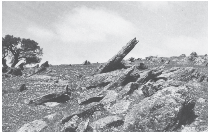
Figure 2(c) Penitent rocks in gneiss, near Tungkillo, eastern Mt Lofty Ranges