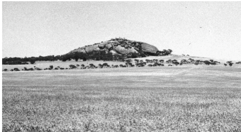
Figure 5(a) Ucontitchie Hill is a dome-shaped inselberg or bornhardt located some 28 km south-west of Wudinna, north-western Eyre Peninsula. It rises abruptly from a gently sloping, conical rise consisting of mantled pediments

Several types of granitic inselberg are now recognised (Twidale 1981). The eponymous bornhardts (Bornhardt 1900; Willis 1934) or dome-shaped hills, are regarded as the basic feature from which are derived two other types of residual hill (Figure 5a). Block- and boulder-strewn nubbins , and known in the United States as knolls , are developed primarily in the shallow subsurface in the humid tropics where weathering is intense (Figure 5b), but also in moist sites in drier lands, as for instance in valleys of the fold mountains of central Australia and just to the north of Alice Springs. The castellated koppies (kopjes) typical of southern Africa appear to be the result of contrasted rates of weathering as between exposed crests and covered flanks (Figure 5c). After landscape lowering small, steep-sided residuals are exposed.