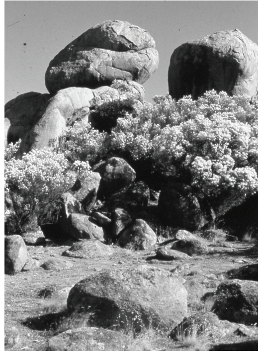
Figure 2(b) Exposed corestone boulders on Palmer Granite outcrop. Two small boulders in the foreground have flared side walls suggesting recent soil erosion and further exposure