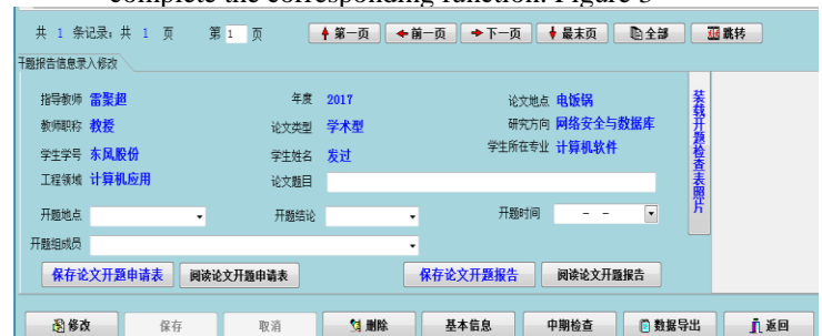
Figure 3. System in a page renderings