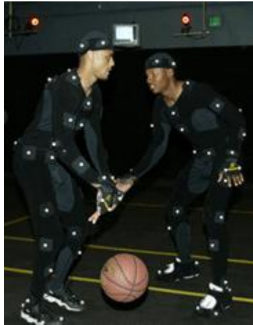
Figure 3: Wearable motion capture cloth for making of video games

research works are also done on area of taste and smell sensors [55]; however they are not as popular as other areas.