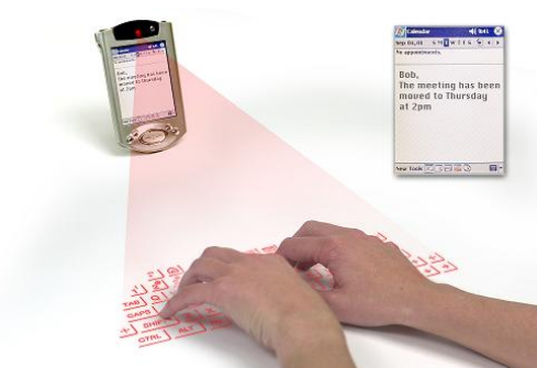
Figure 1: Canesta virtual keyboard [26]

The recent methods and technologies in HCI are now trying to combine former methods of interaction together and with other advancing technologies such as networking and animation. These new advances can be categorized in three sections: wearable devices [19], wireless devices [20], and virtual devices [21]. The technology is improving so fast that even the borders between these new technologies are fading away and they are getting mixed together. Few examples of these devices are: GPS navigation systems [22], military super-soldier enhancing devices (e.g. thermal vision [23], tracking other soldier movements using GPS, and environmental scanning), radio frequency identification (RFID) products, personal digital assistants (PDA), and virtual tour for real estate business [24]. Some of these new devices upgraded and integrated previous methods of interaction. As an illustration in case, there is the solution to keyboarding that has been offered by Compaq’s iPAQ which is called Canesta keyboard as shown in figure 1. This is a virtual keyboard that is made by projecting a QWERTY like pattern on a solid surface using a red light. Then device tries to track user’s finger movement while typing on the surface with a motion sensor and send the keystrokes back to the device [25].