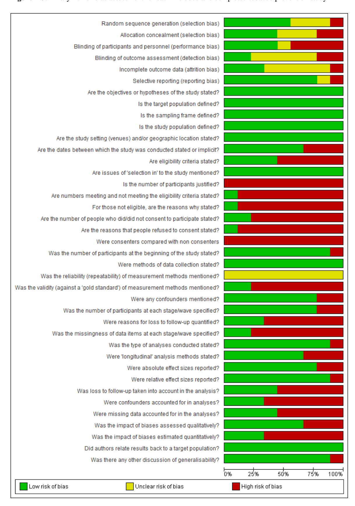
Figure 4 Summary risk of bias assessment for each included and completed tobacco prevention study