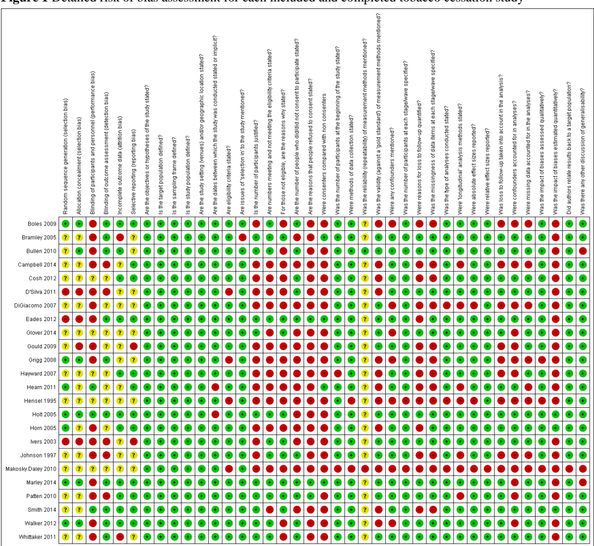
Figure 1 Detailed risk of bias assessment for each included and completed tobacco cessation study