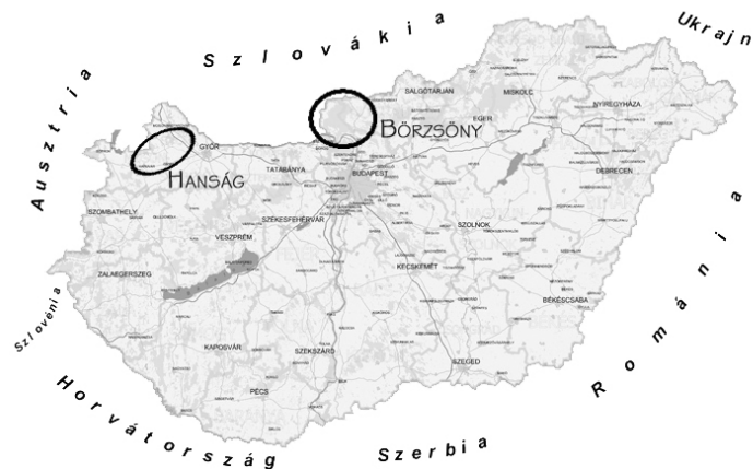
Figure 1. The Hanság and the Börzsöny in Hungary.

We have chosen two frontier areas for field work, which have different conditions (Fig. 1.). All of them are kept in mind as a periphery in Hungary. Börzsöny is the northernmost part of Northern-mountain ranges. It is the popular tourism destination of the metropolitans: it is close to Budapest and is rich in natural and cultural values. The situation of Hanság is quite different and similar to Börzsöny. In spite of the area is situated in the most developed region of the country, it was always considered as a periphery. During the socialism the strictly controlled and closed border region, nowadays the lack of real centre and the lack of co-operation hinders the development of the settlements. Up till the 19 th century the Hanság was a vast marshland. Due to the regulation works we can find just the remnants of the former wetlands.