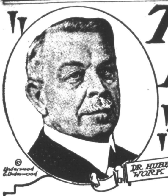
Underwood & Underwood