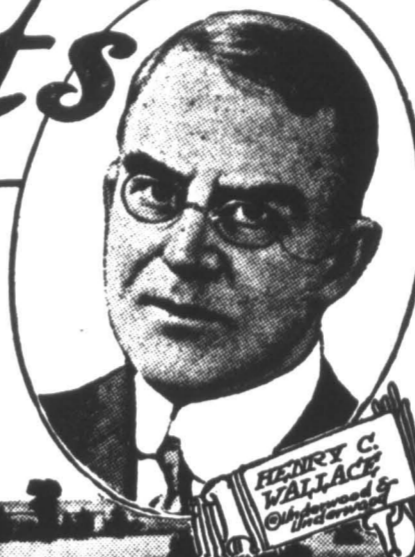
HENRY C. WALLACE