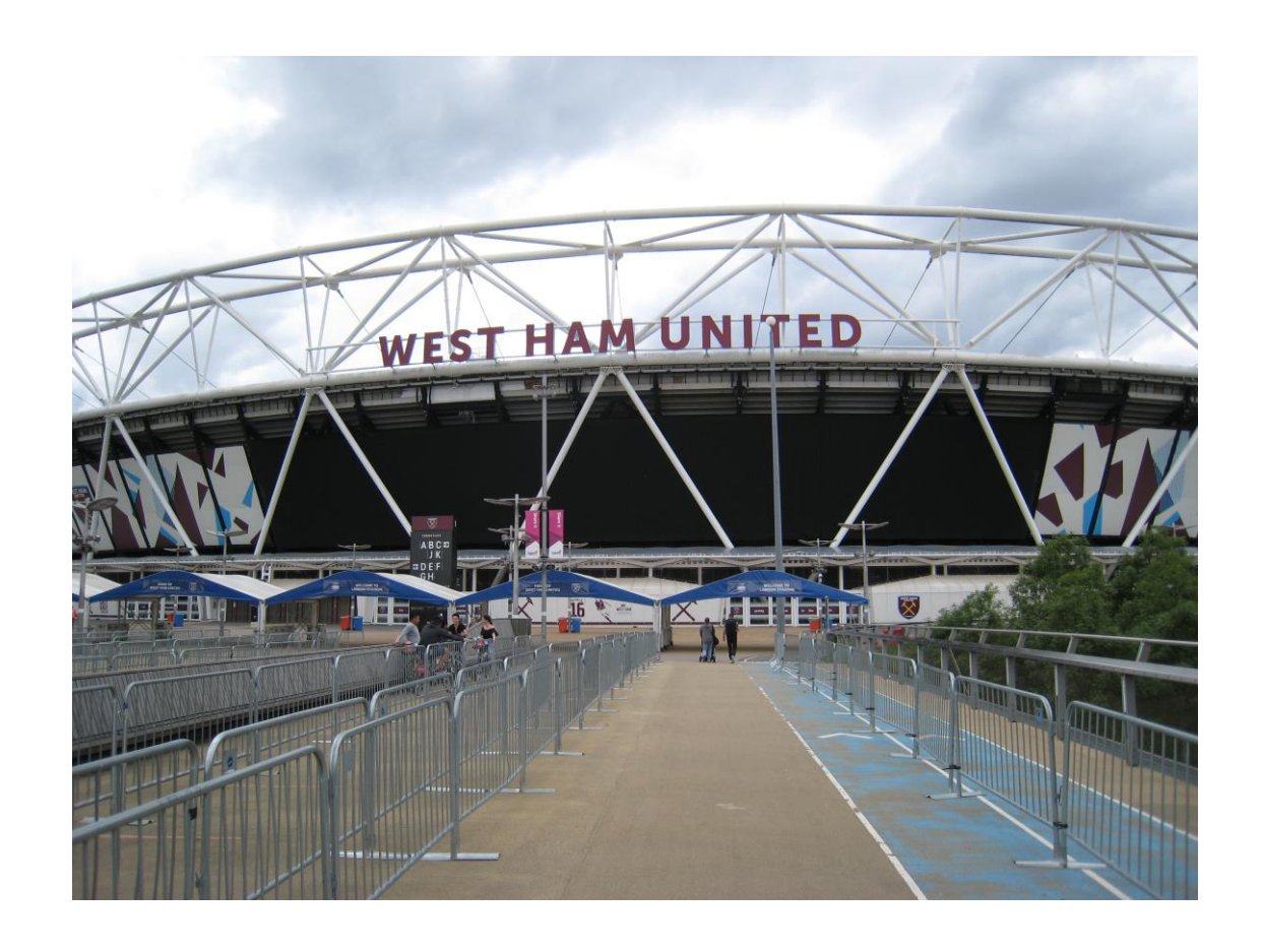
Figure 6 The London Stadium, formerly the Olympic stadium, has been progressively changed in visual terms to give West Ham United, the anchor tenants, a greater sense of belonging.