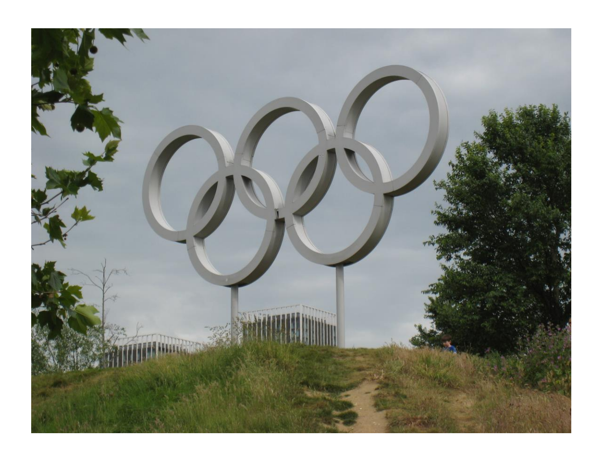
Figure 4 The Olympic Rings sculpture, QEOP (June 2019)