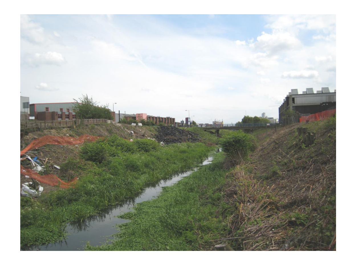
Figure 3 Portion of land in the southern part of the future QEOP as seen in May 2007. It is bisected by the Pudding Mill River, then a tributary of the River Lea. The Olympic stadium was situated to the left of the watercourse, the warm-up tracks to the right.