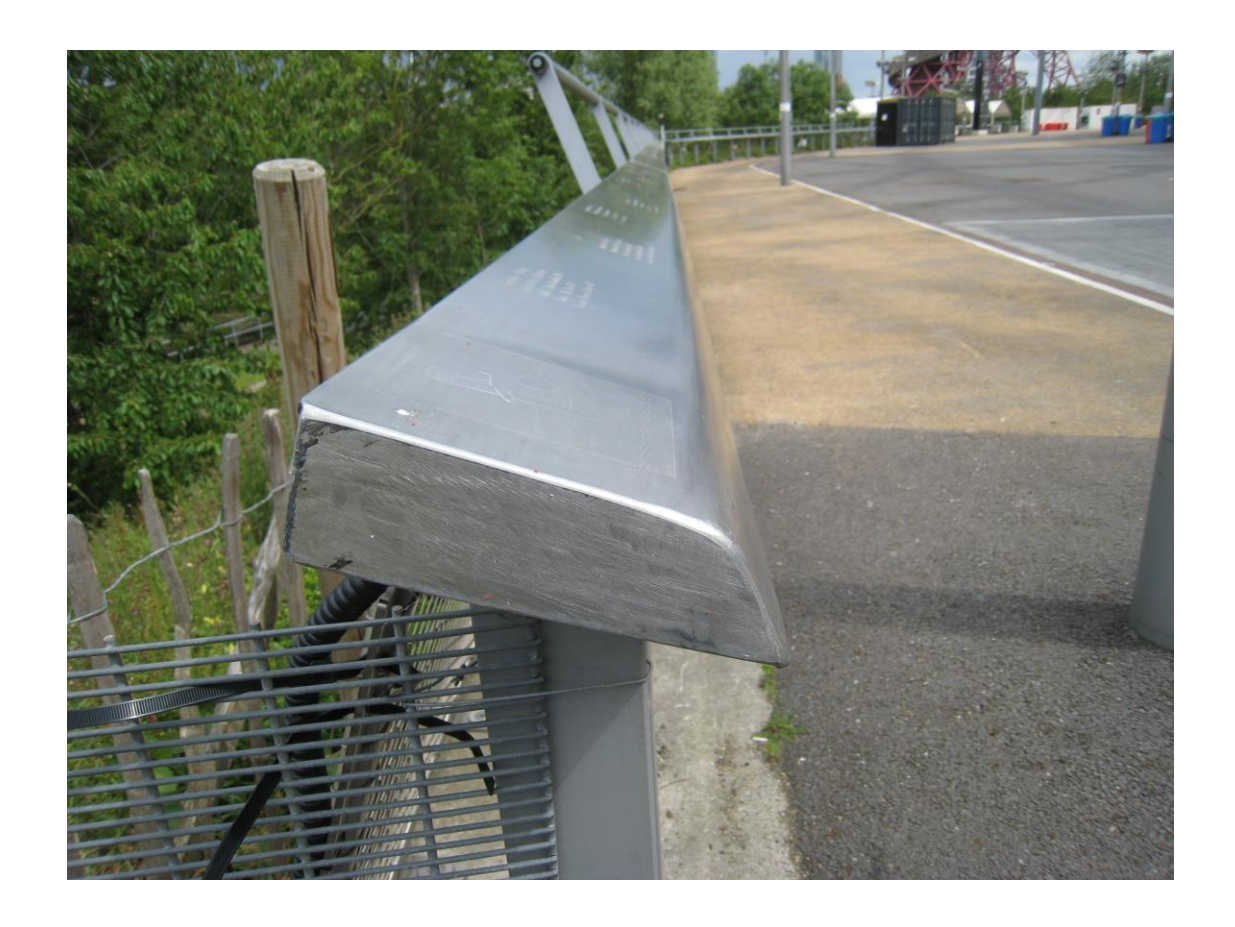
Figure 5 The 'Wall of Champions', an underwhelming version of the display of medal winners (see also Figure 1). A wall only in the sense of being a barrier, the winners names are embossed by alphabetical order of sport on the central rail. (June 2019).