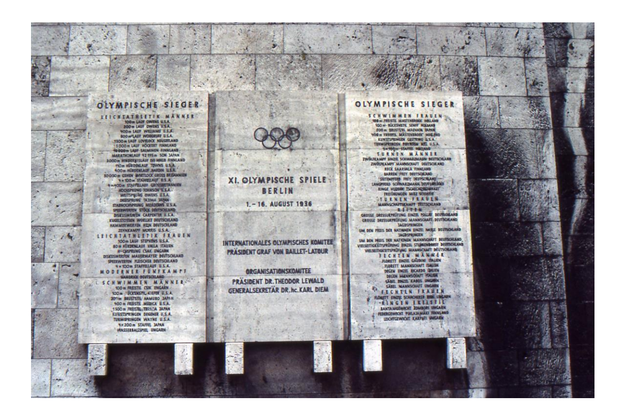
Figure 1 The Olympic Medal Winners board, Olympic Stadium Berlin (photograph taken in 1977)