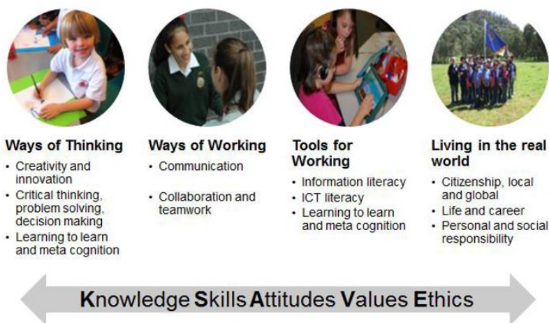
Figure 1. KSAVE Framework [5]

The Assessment and Teaching of 21 st Century Skills (ATC21S) project [5] develops a framework consisting of a hierarchy of skills that play a pivotal role in collaborative problem solving. Due to the role of technology in the workplace and life styles, new skills were needed as well as new emphases on older skills.