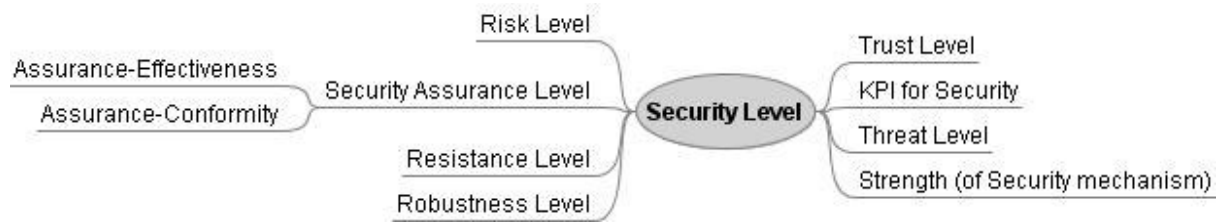
Figure 1: Elements of a Security Level

It may be noted in particular that if the Security Level is, in the same way as for safety, related to notions such as e.g., Risk Level and Trust Level, there are also some other elements that may not have all an immediate counterpart for safety (e.g., threat level, resistance level etc.).