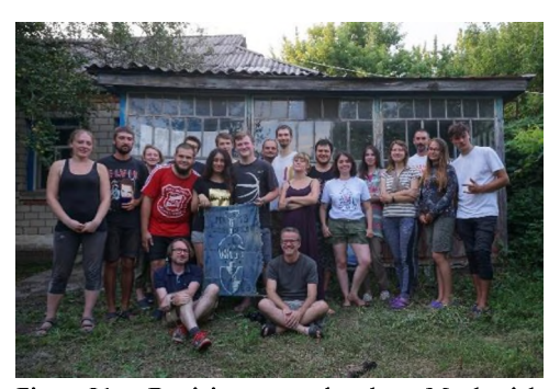
Fig. 34. Participants of the Mezhyrich International Archaeology Summer School.

A separate part of our activities consisted of excursions in the vicinity of the Mezhyrich site in archaeological study order the palaeoecological context: archaeological prospection of the surrounding area; review of collections of Pleistocene faunal remains from the "Tarasova Hora" National Reserve and the Kaniv Historical Museum; visit the mammoth bone dwelling remains of the Epigravettian Dobranichivka site preserved in situ in a museum.