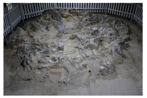
Fig. 33. Mezhyrich. The fourth mammoth bone dwelling.

students during the summer school, which took place from 15 to 30 July.