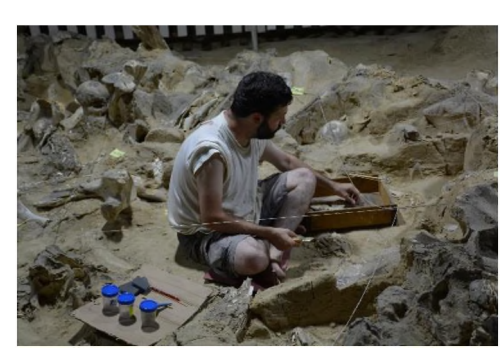
Fig. 32. Working with the bones of fourth dwelling construction.

and chrono-stratigraphical setting of the cultural the palynological, microcharcoal. microfauna and malacofauna content, the zooarchaeological interpretation of the mammal bone material, and typo-technological features of the lithic industry. Mezhyrich is a unique site for conducting both research and for teaching the application of different natural science methods in archaeology within the context of an International Archaeology Summer School: because of a precisely described loess stratigraphy, the very well preserved cultural layers have been yielding representative collections of lithic and osseous artefacts, made of bone, ivory and antler, and faunal remains (Fig. 32).