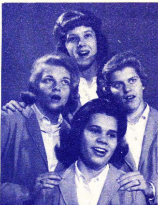
Treble-Aires (ladies' vocal quartet)

H arding College is a Christian liberal arts college at Searcy, Ark., with a student body of 1,200. Work is offered at both the undergraduate and graduate level leading to the Bachelor of Arts, the Bachelor of Science, and the Master of Arts in Teaching degrees — all with full accreditation of North Central Association of Colleges and Secondary Schools.