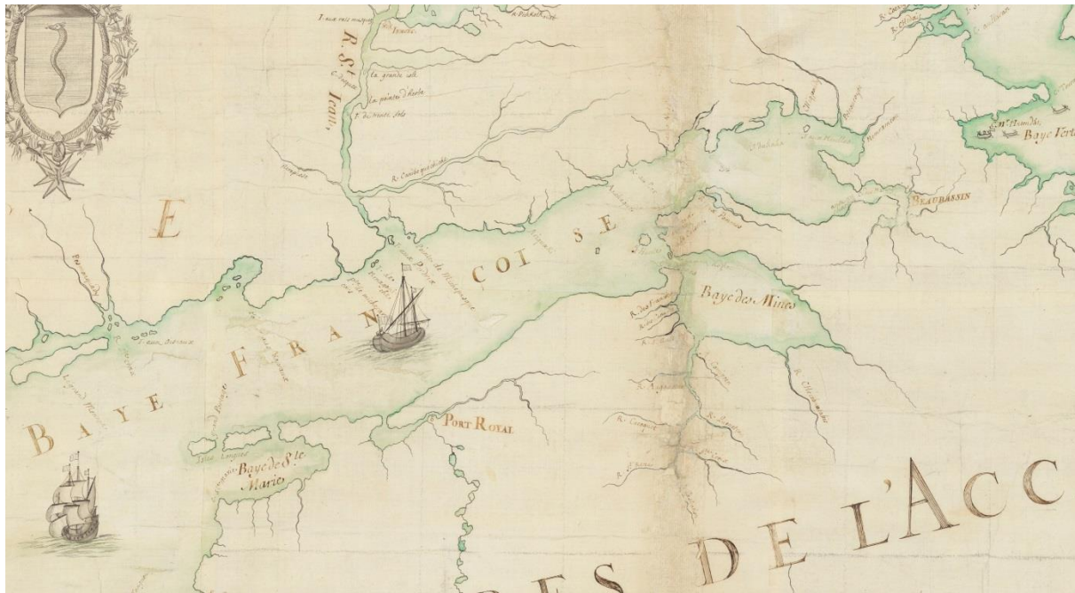
Figure 2. Carte générale du voyage que Monsieur de Meulles intendant de la justice, police et finances de la Nouvelle France a fait par ordre du Roy par Jean-Baptiste Franquelin, 1686 (detail). Map shows the top of what is today the Bay of Fundy.

1691, removed the seat of French government first to Jemseg, then further up the rivière Saint-Jean to Naxouat (Nashwaak), and finally, after the war ended in 1697, to fort Saint-Jean at the mouth of the river. 12 Villebon continued to exercise influence on the French habitants through La Tourasse, however, his absence left the French settlements open to the depredations of English privateers, as well as at least one further attack from New England, namely Benjamin Church's raid on Beaubassin in September 1696. 13