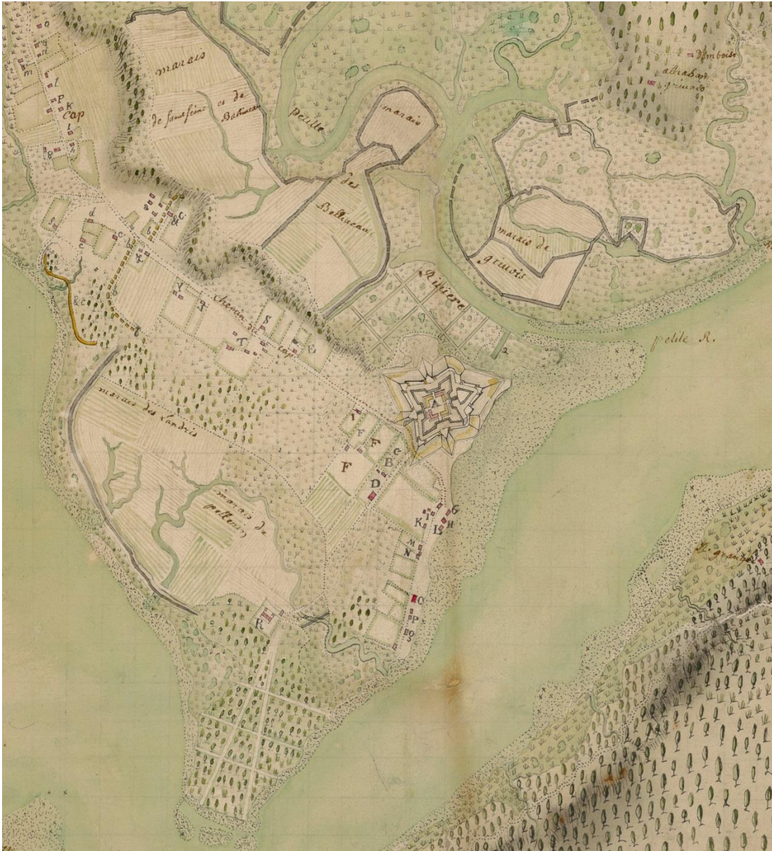
Figure 3. Plan de la banlieue du Port Royal , attributed to Delabat, 1708 (detail).

Enclosed marsh belonging to multiple parties, even when first owned in common, were typically divided into separate plots and worked individually. An eyewitness account from the British period suggests that areas of the marsh in Grand Pré were first enclosed and worked by multiple parties and then divided into individual fields. In 1746 or thereabouts Otis Little, a New