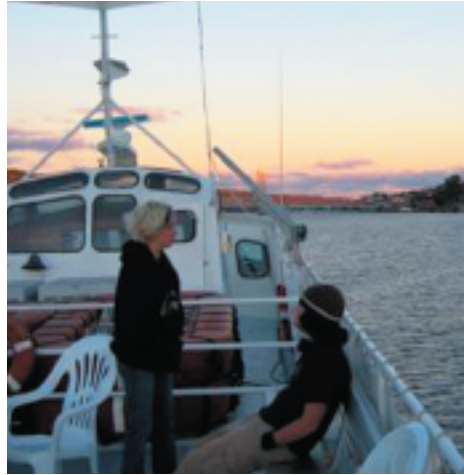
September 2005 Keweenaw Star Boat Trip, Sponsored by the Department and organized by Student Chapter of AIChE