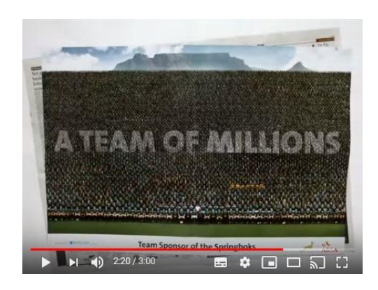
Figure 4: Absa Team of Millions (Coloribus 2018a)