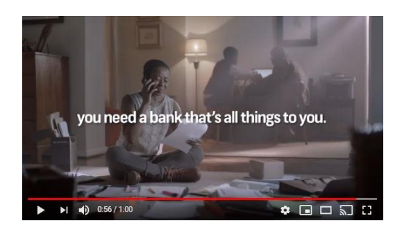
Figure 5: FNB You Need a Bank That's All Things to You (FNB SA 2016)