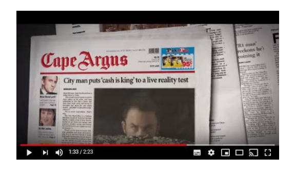
Figure 7: Sanlam R1 Man (Coloribus 2018