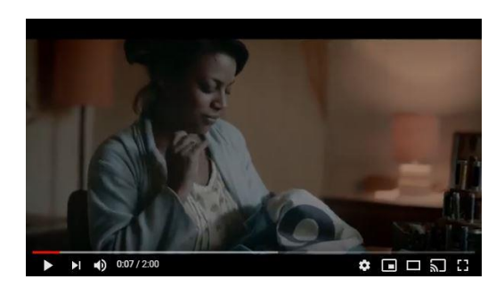
Figure 6: FNB The Helpers (Produce Sound Studio 2018)