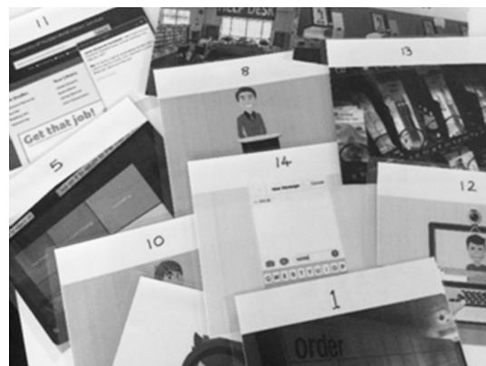
Figure 2 14 images featuring different help desk scenarios.

I intended also to get delegates to have a go, repeat the exercise I describe above and