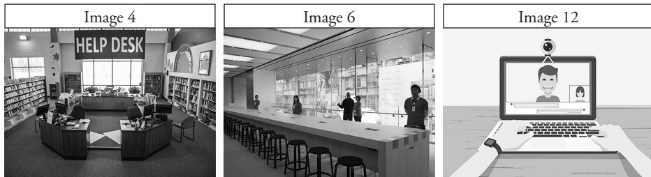
Figure 1 Help desk scenarios.