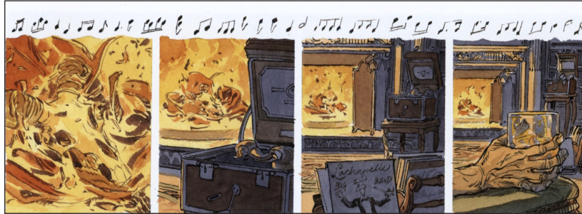
Figure 5: Juan Diaz Canales and Juanjo Guarnido, Blacksad: A Silent Hell , 2012, Dark Horse Books, p. 52.

the villain. The music is Lachapelle's own Big Band music, and the album shows a younger version of himself commanding the band from the front. In A Silent Hell , music is a focal point in the plot and is used to reveal villains, deaths and emotions. The tension between music and silence in the comics form is most noticeable in this album. The music at the top of the panels both guides the eye of the reader as well as guides them to the conclusion that Lachapelle is the villain. The inherent silence of the panels and lack of dialogue creates and builds the tension toward the reveal.