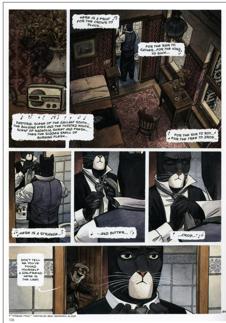
Figure 2: Juan Díaz Canales and Juanjo Guarnido, Blacksad , 2010, Dark Horse Books, p. 106.

Like in film noirs, the diegetic music in Blacksad is also used to reveal the interiority of the protagonist and as foreshadowing. Miklitsch suggests that in films such as Orson Welles' Citizen Kane (1941), Fritz Lang's Scarlet Street (1945), Curtis Bernhardt's Possessed (1947) and John Brahm's The Locket (1945), diegetic music "becomes, in tandem with signature visual flourishes, an expressionist device to capture the tortured interiority of the main character" (2011: 3). This is also true in The Big Sleep where Bacall's character sings with a live band while in the gambling