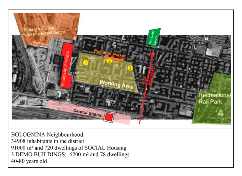
Figure 4: Bolognina working area. Bolognina Neighbourhood: 34,908 inhabitants in the district; 91,000 m<sup>2</sup> and 720 dwellings of social housing; 3 demo buildings: 6200 m<sup>2</sup> and 78 dwellings. 40–80 years old.

tion systems and durable – easy to maintain – materials plays a key role. Furthermore, the selected materials are expected to satisfy a service life of 50 years (according to the literature), in order to enlarge maintenance intervals [22];