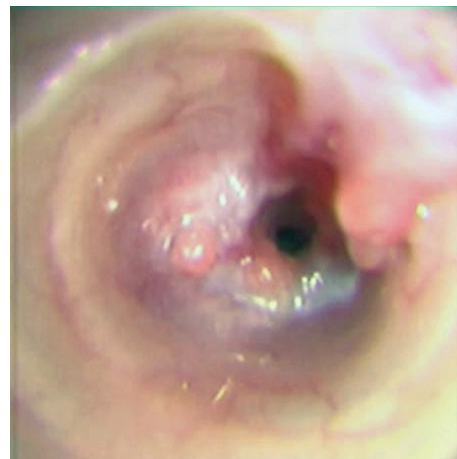
Figure 2. Endoscopic view of the distal trachea (Pentax EG-1840 with 6 mm diameter shaft and 1050 mm working length). Tracheal stenosis with marked luminal narrowing

A marked and irregular concentric tracheal stenosis of the distal part of the trachea was observed (Figure 2). The tracheal diameter at the level of