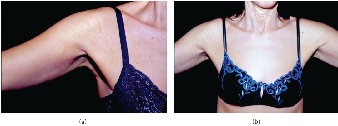
FIGURE 3: (a) One month after surgery. Recovery is still incomplete with reddish surrounding skin. (b) Six months after surgery. Good clinical recovery, with a thin linear scar.

difficult and unstable. In the wider series published, no particular surgical trouble was described [3]. In the present case, on the contrary, we observed serious practical difficulties conflicting with such assertions. Suturing problems were resolved by applying more stitches than usual and by placing some loose ones quite distant from the margins in order to reduce tension. Elastin defect and calcification in the walls of small arteries could be potentially responsible for poor postretraction haemostasis, and excessive bleeding could be expected. On the contrary, no such problems occurred, as described also in other works about surgery in PXE patients [3].