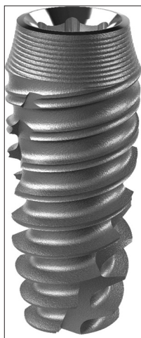
Figure 3: Dental implant

composition), underwent a double sand-blasting process (corundum and aluminum).