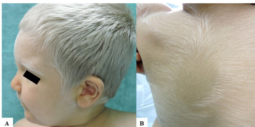
Figure 1. Clinical findings of our patient. (A) A 2-year-old Caucasian child with congenital silvery gray scalp hair, eyebrows, and eyelashes and fair skin. He had also brown irises and very fair skin with mild tanning capacities after sun exposure; (B) Diffuse silvery hypertrichosis: unmedullated, short, and soft hypopigmented hairs on the back of the patient.

Our patient's history was remarkable also for a diagnosis of hemophagocytic lymphohistiocytosis (HLH), manifested at 3 months of age as an acute severe multiorgan disease with fever, hepatosplenomegaly, pancytopenia, and lymphadenopathy. Chemotherapy and hematopoietic cell transplantation from match unrelated donor were performed with immunological reconstitution. At 2 years of age, the patient was in good condition and assumed oral cyclosporine and corticosteroids. Due to systemic medications, he developed a generalized acquired hypertrichosis involving the entire body hairs, which were silvery, likewise scalp hair, eyelashes, and eyebrows (Figure 1B). Hair light microscopy showed giant uneven melanin granules mostly located approximately in the medullar zone. They were larger than those present in normal hair (Figure 2).