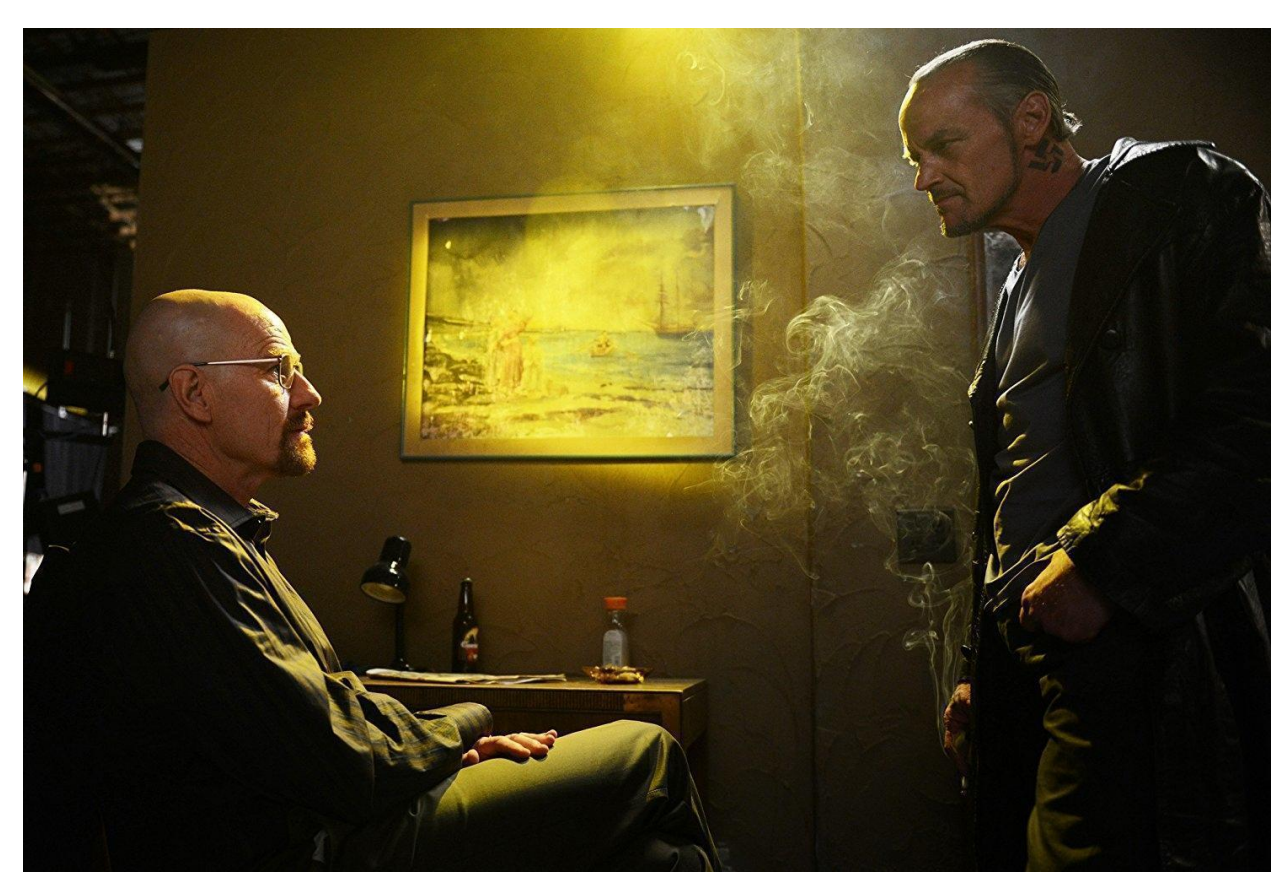
Figure 3.

The appearance of the painting in "Gliding over All" echoes the line in Whitman's poem: "As a ship on the waters advancing / the voyage of the soul—not life alone" (232). Walt might have procured the necessary funds for his family, but working with Neo-Nazis—in effect bringing about the full collusion of capitalism with fascism—is a pollution of the soul that contravenes Whitman's promotion of vox populi and constitutes a step too far for Walt. For Whitman democratic commitment is obtained, as Jason Frank states, "through the poetic depiction of the people as themselves a sublimely poetic, world-making power" (403). Freedom in Whitman's conceptual framework is about true aesthetic, rather than political, equality, and not about a self-interested notion to do as one pleases according to one's own needs. Now that the impetus for Walt's criminal career is negated by his desire to claim some sort of legacy in a selfish act of hubris, any claims of freedom and disenfranchisement have to be weighed against the violence of his actions and the parties involved in those actions—all without any self-justifying rationalizations.