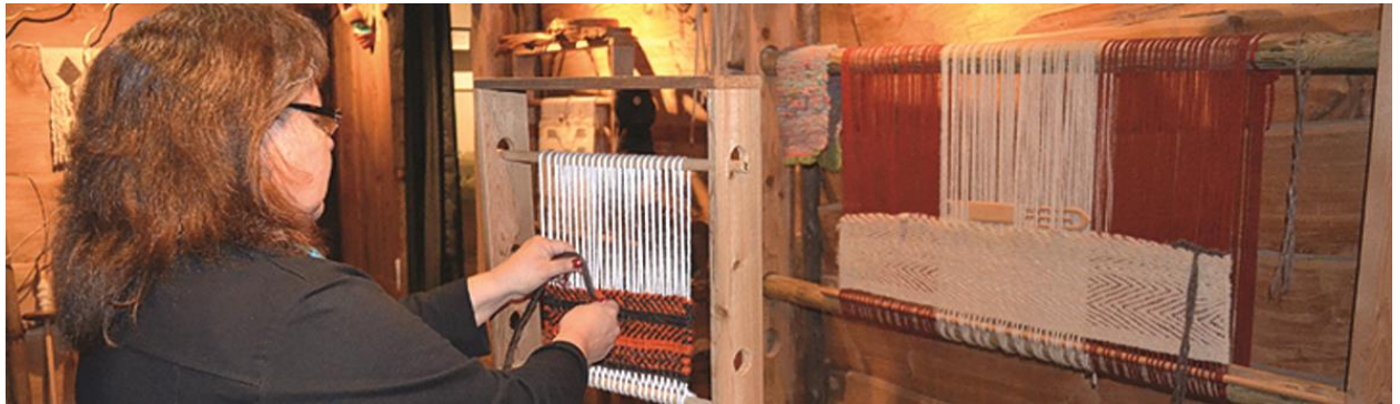
Figure 3.1: picture of a Stó:lō loom, taken from http://www.stolotourism.com/about .