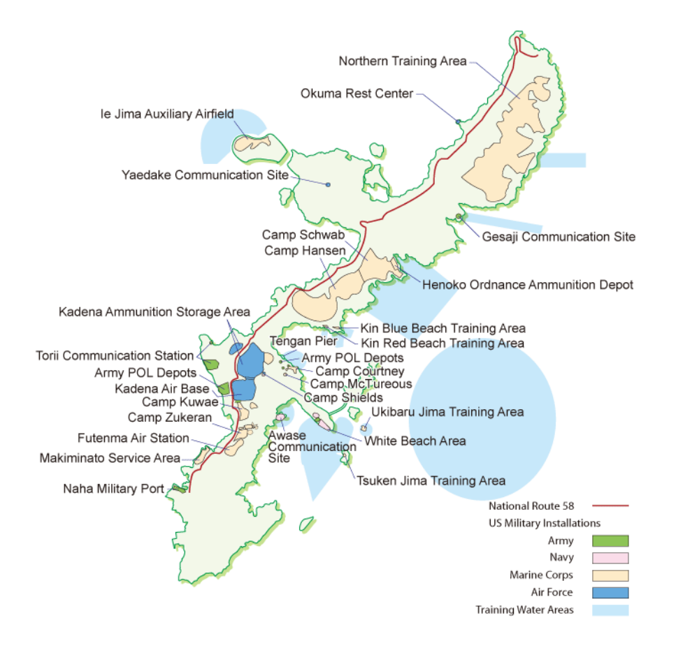
Map 1. "Map of U.S. Military Bases in Okinawa" Okinawa Prefecture Military Base Affairs Office, 2014