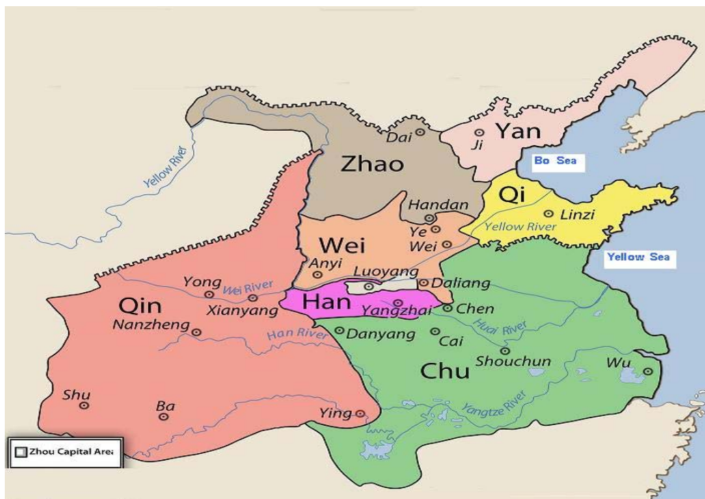
Figure 1: The Location of the Seven Powerful States

At the beginning of the Warring States period of ancient China (453-221B.C.), there were seven powerful states or regimes whose rulers were in contention to conquer one another and eventually unify the country 1 . These seven states were Qin, Qi, Chu, Yan, Han, Wei, Zhao, which were, as shown in the figure below, geographically located as Qin in the west, Qi in the east, Chu in the south, Yan in the north, and Han-Wei-Zhao in the central region, where Han was roughly in the south part, Wei in the middle part, and Zhao in the north part of the central region.