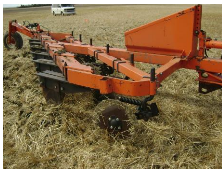
Figure 1. Non-inversion subsoil tillage implement called a Paraplow in operation

Paraplowing is a form of non-inversion subsoiling sought after by producers for its effectiveness at loosening soil structure without compromising the soil conservation practices that are already employed on the farm. Soil structure can be a limitation to crop production in irrigated cropping systems (Grevers and de Jong, 1992). Soil structure has implications on water infiltration, storage, and runoff from the soil surface. Modifying the soil structure by mechanical means can be effective in loosening soil structure. Creating a soil environment with fewer limitations for plant growth. This study aims to evaluate a subsoiling using a Paraplow, a bent leg subsoiler producer by Howard Rotovator. Observing how it modifies the soil structure by looking at soil bulk density, moisture content, and crop response to determine if there economic benefit to subsoiling in Saskatchewan.