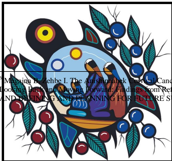
Figure 6. 1: The Anishinaabek Cervical Cancer Screening Study 6

Using eye-catching pamphlets and storytelling techniques in cancer screening are good ways to promote Indigenous women's health, especially health education that respects the depiction of female bodies and sexuality from an Indigenous perspective. (141) For example, "T-shirts, pens and buttons should be consistent with its message and capture the attention of different generations". (148,149) p.336 In a previous study, a local artist was hired to create the promotional imagery for Indigenous health education. (52)