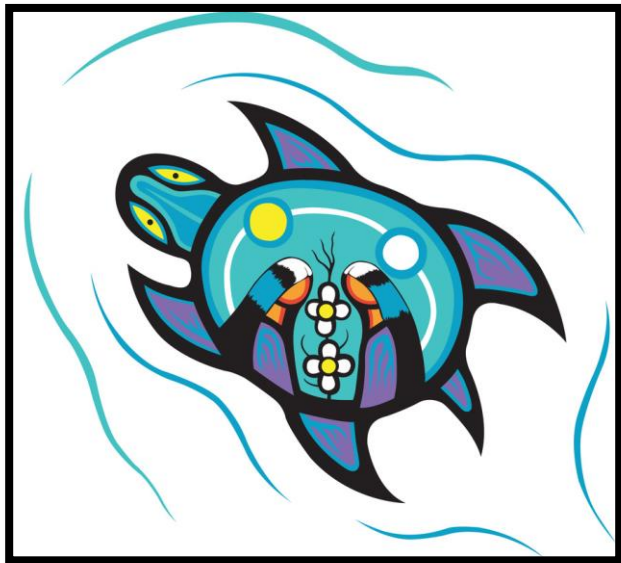
Figure 6. 2: Turtle Logo for Anishinaabek Screening Study Cervical Cancer Screening 7

Breast cancer screening and treatment options available in the patient's native language, specifically in audio and video format, would be beneficial as well; those who only speak their traditional Indigenous language are more likely to be illiterate, so written health material would be of no benefit. (88,117) Thus, another option for health education outreach would