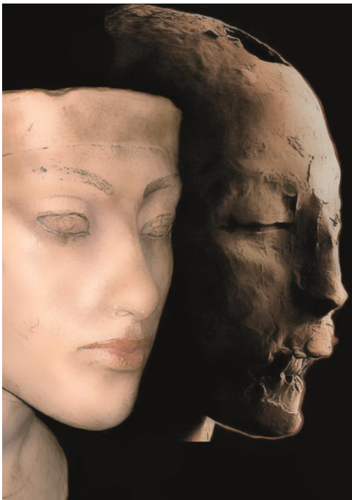
Fig. 3: The mummified skull of Henut Tau. Balabanova and Parsche (1992) found the first traces of the alkaloids nicotine and cocaine in this mummy. Later, they were able to discover these same alkaloids in other Egyptian mummies. But cocaine has only been found in Egyptian mummies, while nicotine has been identified in human remains in Europe, China and in the Levant.

Alkaloid cocaine has been detected (Fig. 3) in the 1992 examinations of the mummy of Henut Tau. Hair samples were taken and it was found that these samples contained nicotine [24].