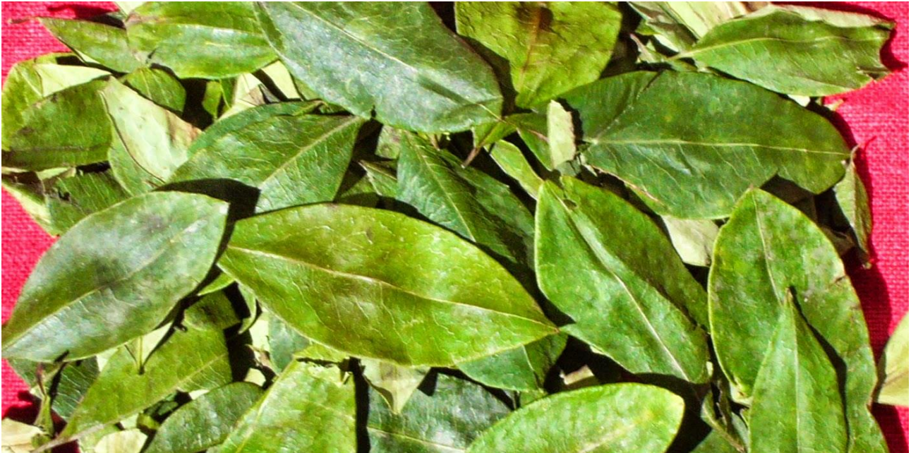
Fig. 1: Representatives of the coca species are spread throughout the southern hemisphere. Only two species in the World (Neotropics) produce the alkaloid cocaine in sufficiently high concentrations for human consumption. This picture shows the leaves of the species Erythroxylum coca, which enjoys the greatest popularity among the Andean nations. Finds of cocaine in Egyptian mummies by Balabanova & Parsche [5] caused great controversy when first announced.

The genus name Erythroxylum refers to the characteristic red-colored wood and the red bark of these plants (Fig. 1). The original name coca originates from the Aymara word "khoka", which simply means 'tree' in the language of this ancient American tribe.