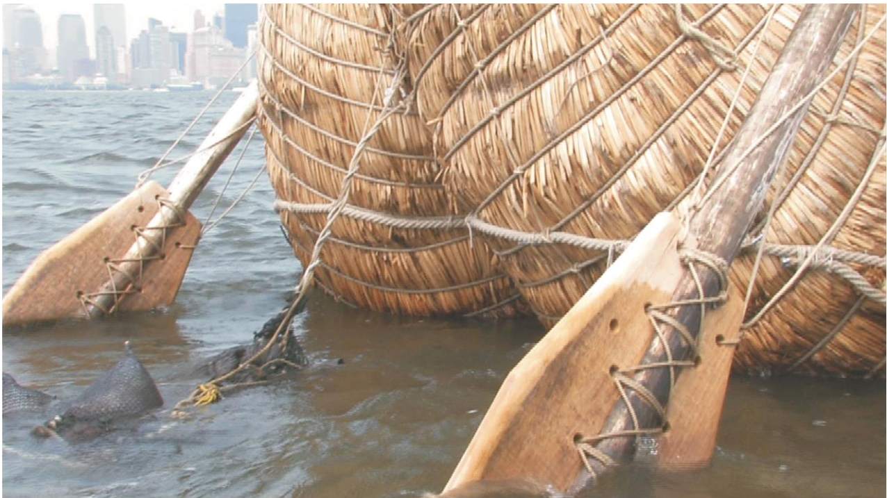
Fig. 4: In trawls behind all ABORA reed boat expeditions, the writer examined the drift ability of multiple crops. Many types were tested and had no drift ability. Only tobacco and bottle gourds possessed a fair share of salt-water tolerance (approx. 200 d). This is, however, too little to explain an Atlantic Ocean drift in recent prehistoric times without human intervention. Furthermore, the ABORA Expeditions (I-III) prove experimentally that Stone Age seafaring across the large oceans might have been existed in prehistory.

The ocean drift experiments made by my team, between 1999 until 2007 (Figs. 4 & 5), produced realistic measurements to show that the seeds and fruits of crops cannot drift for months across the Atlantic [44]. Trans-Atlantic dispersal from Africa to America and in the opposite direction, without the support of early man, appears to be very difficult. The results restrict broader speculation and fix the spread theories to a realistic basis.