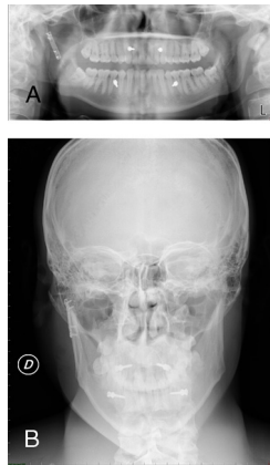
FIGURE 3. A and B, Postoperative conventional radiography demonstrating the successful reduction.

follow-up. This patient complained of a slight malocclusion and a TMJ dysfunction; an orthopantomography was performed, revealing the postoperative complication. Although we can speculate that this condition was due to a potential avascular necrosis of the condylar head, we did not find a feasible etiopathogenesis.