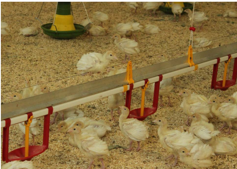
Figure 1.1.1-1 Two-week-old BUT10 turkeys.

Turkey poults leave the hatchery directly after hatching and are introduced to a thoroughly sanitized production unit. However, getting turkey poults established in their new environment is not as easy as with broiler chicks and laying hen chicks, and substantial efforts are required in order to succeed. Cardboard brooder rings are commonly used in Norwegian turkey houses for at least the five first days of production in order to provide the turkey poults with an appropriate environment and keep them close to the heat source, and with food and water easily accessible. Other approaches to room sectioning may also be applied. Starter rooms (smaller rooms with more economic climate control than in the entire poultry house) are used by 1/3 of the Norwegian turkey farmers (mostly in the Trøndelag region).