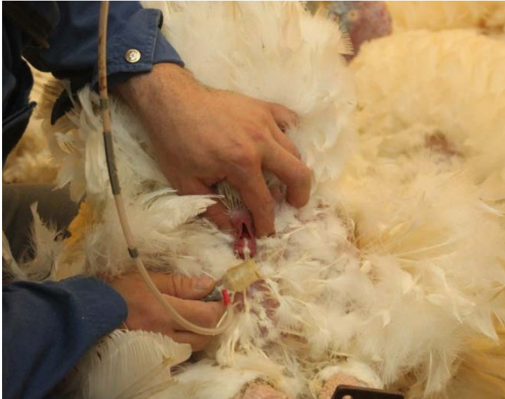
Figure 1.6-1 Semen collection from a breeding tom.

Semen collection involves massaging the cloacal region to achieve phallic tumescence. This is followed by a "cloacal stroke", squeezing the region surrounding the sides of the cloaca to eject the semen (Bakst and Dymond, 2013) (Figure 1.6-1).