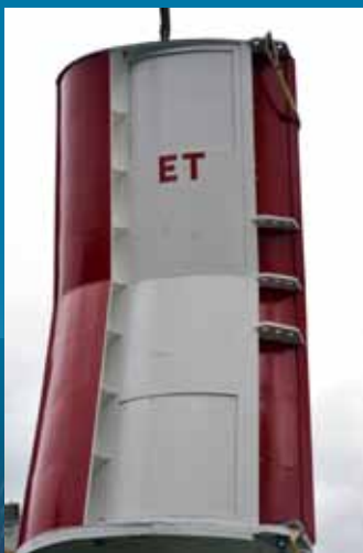
Figure 4: Trawl doors with hatches that can be opened/closed to adjust performance while fishing.