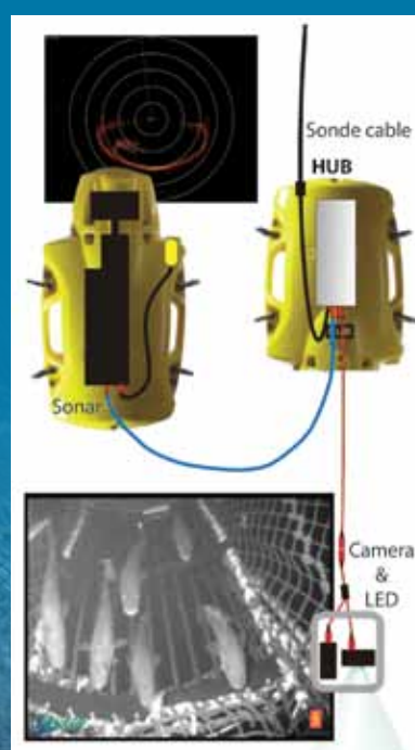
Figure 2: Combining observation with sonar and camera during trawling.