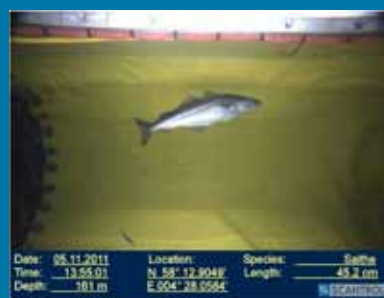
Figure 1: High-quality imaging inside a trawl can be used to estimate size and species.