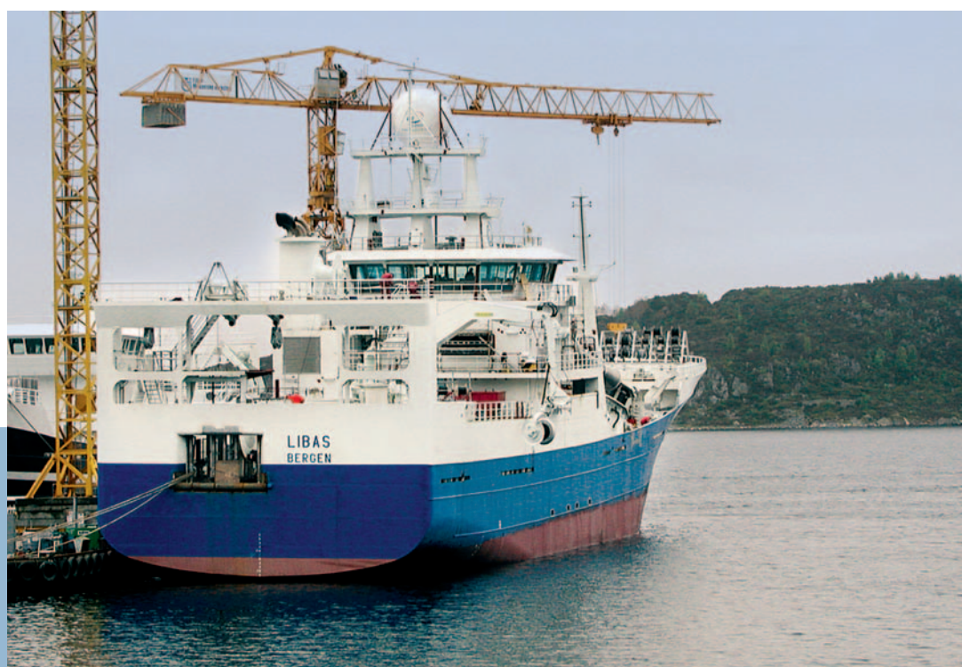
"Libas" lies at the quay in the shipbuilding yard.

Scientists will be able to control the equipment from their offices, and hence, collect data while the vessel is in commercial operation. "Libas" is also well-equipped to supplement the Institute of Marine Research's research vessels when needed. The vessel has been designed to produce low levels of noise and for high-speed sailing, and is thus an efficient survey vessel. Its first cruise is planned for July 2004, when distribution, densities and behaviour of mackerel are the main tasks.