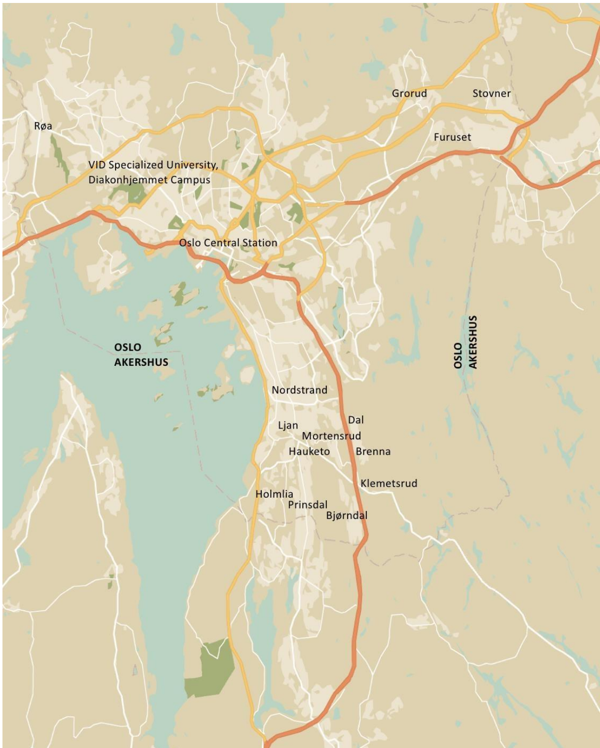
Map 1: Map of Oslo showing the places mentioned in this thesis.