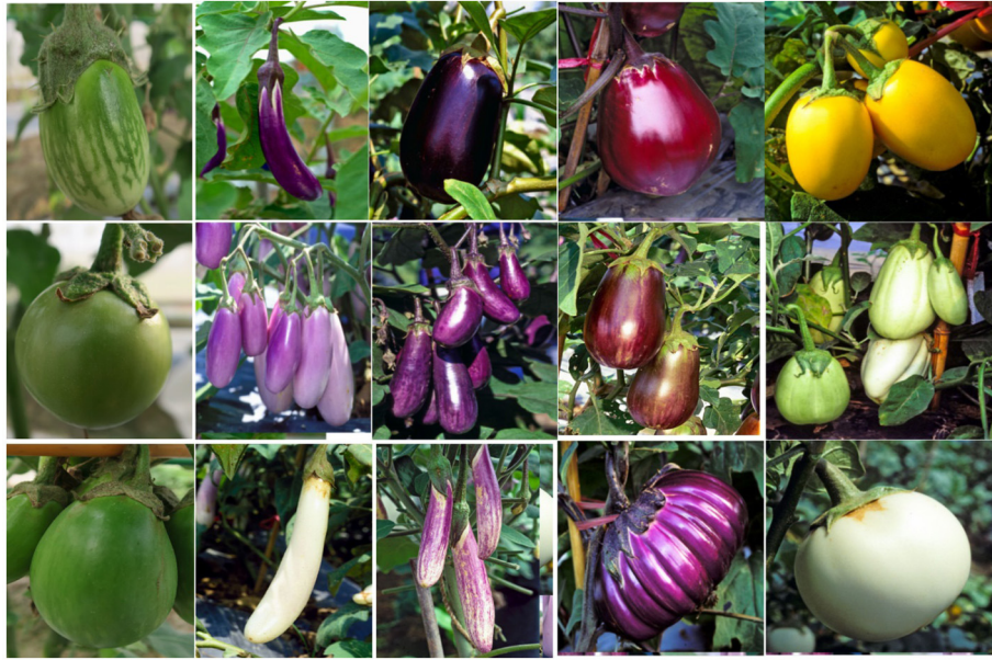
FIGURE 3 | Different fruit shapes, colors, and sizes of Solanum melongena accessions in the World Vegetable Center germplasm collection.