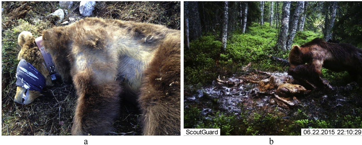
Fig. 2. A 15-year-old male brown bear ( Ursus arctos ), ID No. W1211, parasitized by Trichodectes pinguis pinguis . Notice the areas with partial or complete hair loss, hyperpigmentation and lichenification of the skin. a) April 2015 at the time of capture. b) June 2015 when feeding on a carcass.