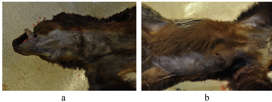
Fig. 3. Brown bear ( Ursus arctos ) killed because of human-wildlife conflict in south-central Sweden in May 2015. The bear showed extensive alopecia in the area covering a) the chin, ventral part of the neck; b) axillar region, and abdomen.