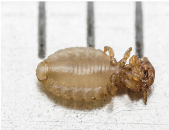
Fig. 4. Specimen of Trichodectes pinguis pinguis recovered from a brown bear ( Ursus arctos ) killed because of human-wildlife conflict in south-central Sweden in May 2015. The distance between the measuring bars is 1 mm.

Giebel in 1874. Despite this early description, there are very few published reports of the parasite in the literature. The next description of the louse was published by Burmeister in 1838 using Nitzsch's material. In 1948, Werneck described the female form of the parasite using samples from the British Museum that were