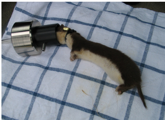
Fig. 2: Least weasel receiving the anesthetic through the facial mask. The animal was ear-tagged and radio-collared.

Isoflurane from a 10 ml gas-tight glass syringe was mixed with air in the vaporizer and was delivered in useful, safe concentrations for the anesthesia via the wooden chamber or a facial mask. The air came from an air pump connected to the unit (Fig. 1). From the vaporizer, isoflurane mixed with air flowed through a tube where an incorporated valve allowed the inhalant anesthetic to be directed either towards the anesthetic chamber or the facial mask. After induction in the anesthetic chamber, by turning a switch in the valve to reroute the anesthetic towards the facial mask placed around the animal's head, the anesthesia could be maintained outside the anesthetic chamber (Fig. 2).