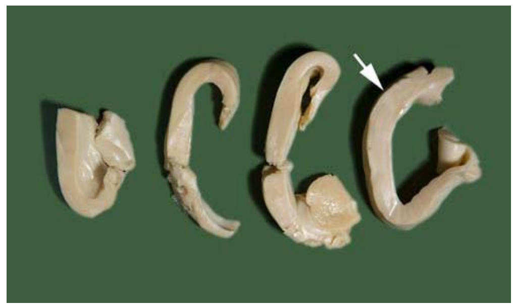
Fig. 2 Sections of the brain (formalin-fixed) showing severe loss of subcortical tissue and thick cortical ribbon (white arrow) in a 13- month-old wild-born brown bear

Fig. 1 The flaccid brain with extremely flattened convolutions due to an internal hydrocephalus of a 13-month-old wild-born brown bear. The cerebellum (white arrow) appears to be normal. It is visible between the very soft hemispheres