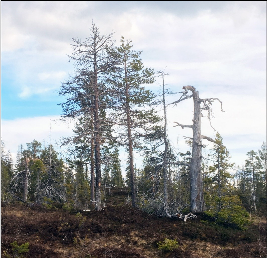
Figure 2. The habitat for Lecidea subhumida in Danielåsen, northern Norway showing an open forest dominated by Pinus sylvestris including snags and kelo trees with scattered Picea abies .