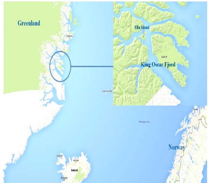
Fig. 1. Ella Island and King Oscar Fjord map

On 4 September 2013 the cruise ship Arctic Victory went missing in the Greenland Sea. All ships in the Greenland EEZ are obliged to send a message to the GREENPOS system with information on position, course, speed, and destination every six hours. When the mandatory message from Arctic Victory did not arrive at the Maritime Rescue Coordination Centre (MRCC) in Nuuk, it notified other Rescue Coordination Centers in the High North and asked all available aircrafts and surface vessels for a search operation in the Greenland Sea. Next day, the Arctic Victory reported its position. However, the day after Arctic Victory ran aground near Ella Island in King Oscar's Fiord with all 200 passengers and 50 crewmembers on-board, an explosion in the engine room resulted in multiple injuries, fire on-board and tilting of the ship. Hence, the need arose for an extensive rescue operation to save the crew and the passengers who either were on-board the vessel or had entered the vessel's life rafts.